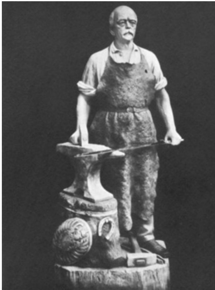
A statue of Bismarck as Germany's creator. It shows him making weapons which would be used to unify Germany.