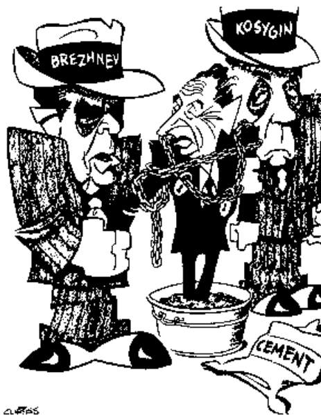
An American cartoon about the Soviet invasion of Czechoslovakia in 1968. It shows Brezhnev and his deputy as gangsters. The man in the middle is Dubček. His feet are being dipped in concrete.