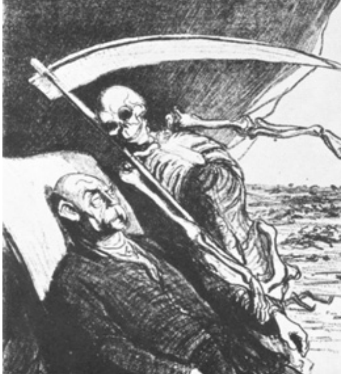
A cartoon showing Death thanking Bismarck for the thousands killed in the course of unification.